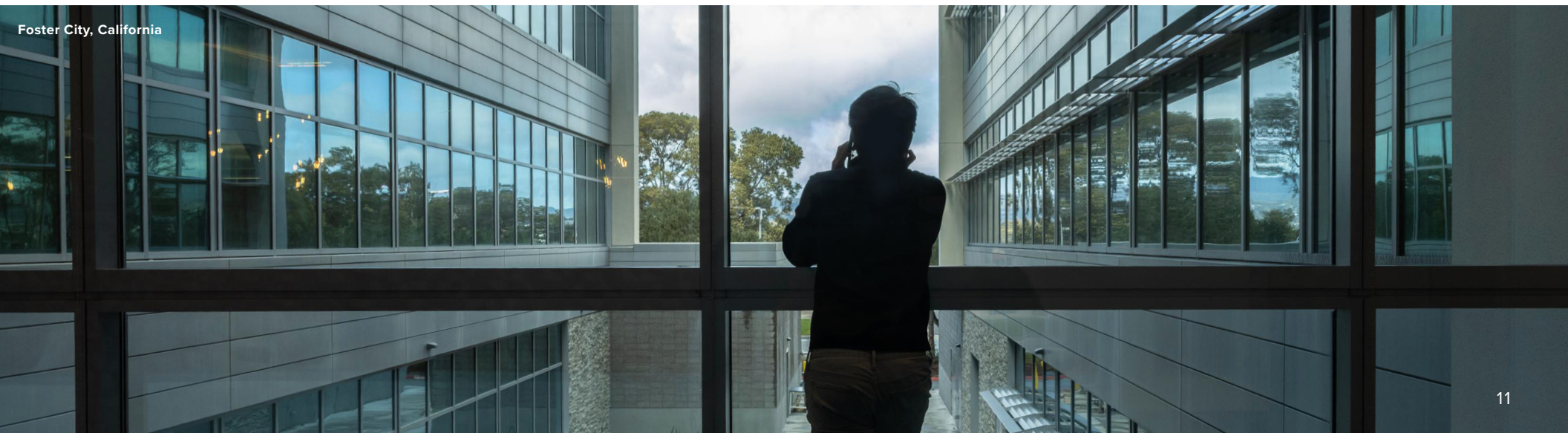
Foster City, California

We monitor proposals and changes to tax incentives and regulations in the countries in which we operate in order to assess their impact on our business. From time to time, Gilead may collaborate with taxpayer advocacy groups to ensure Gilead's views are considered during the public discourse. We also support initiatives to increase public trust and transparency in national and international tax regimes.