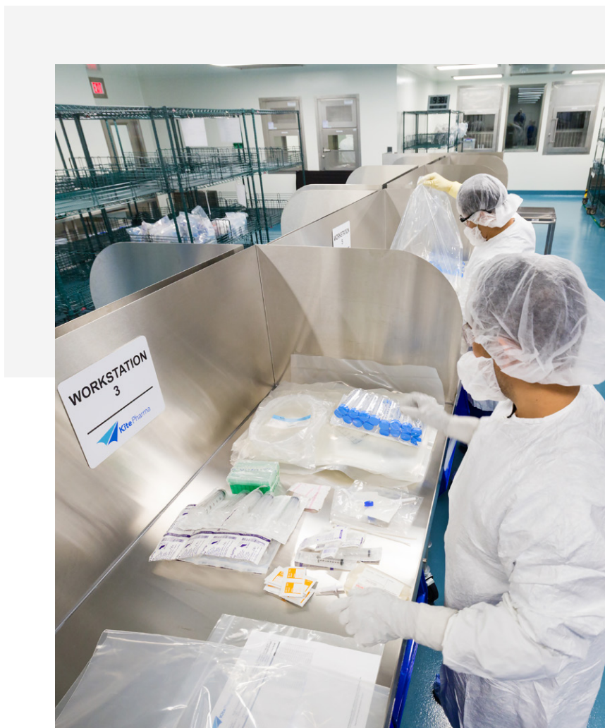
Kite employees in Santa Monica, CA

In December, Gilead acquired Cell Design Labs, a company with significant expertise in custom cell engineering that is currently developing two proprietary technology platforms: synNotch™, a synthetic gene expression system that can be used to engineer customized therapeutic responses in